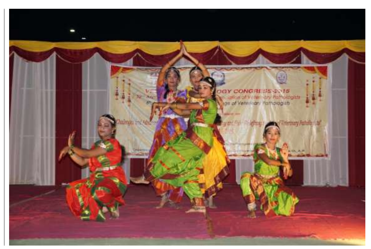
Cultural Night by Students of NTR College of Veterinary Science