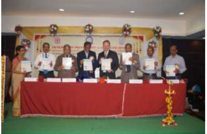
Release of Hard Copy of CVE Lecture on Pig Diseases Release of The Lesion, 2015